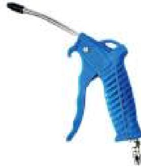
SY9101 Blow Gun