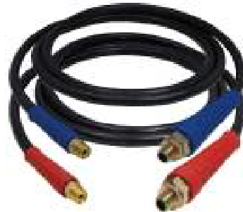
SY9003 AIR RUBBER HOSE