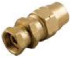
SY1500 FEMALE CONNECTOR