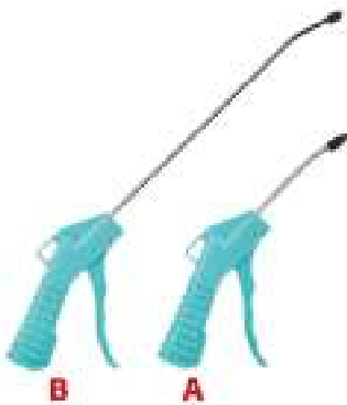
SY9105 Blow Gun