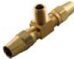
SY1172 TEE UNION