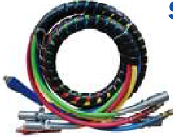
SY6001 FOUR IN ON