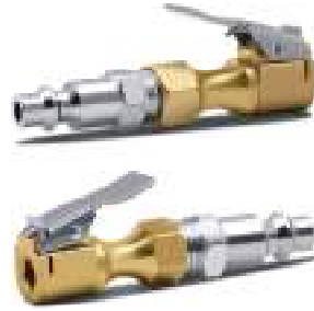
SY9201 AIR CHUCK SET