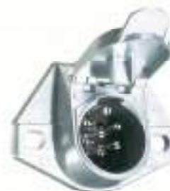
7 WAY SOCKET