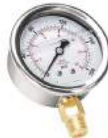
SY9203 OIL PRESSURE GUAGE