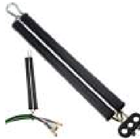
SY6200 HOSE HOLDER