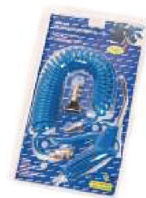
SY9106 Blow Gun