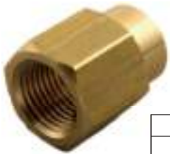
SY7733 Reducing Coupling