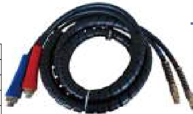
SY9005 TWO IN ONE