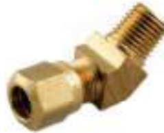
SY1474 MALE ELBOW