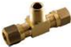
SY1472 MALE TEE