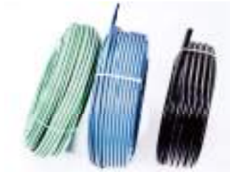
SY9007 DOT SINGLE LAYER AIR HOSE-PA12