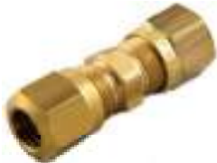
SY1462 STRAIGHT UNION