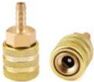
SY9202 BARBED AIR CHUCK