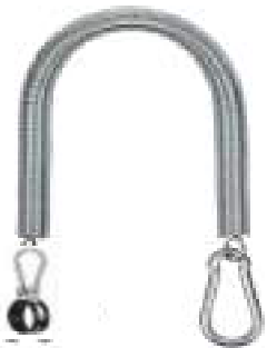
SY6201 SPRING HOSE HOLDER