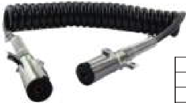
ONE WIRE POWER CABLE