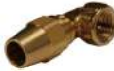
SY1170 FEMALE ELBOW