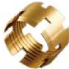
SY1490 MALE ELBOW