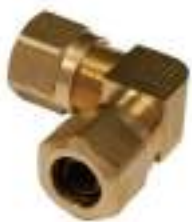
SY1465 ELBOW UNION