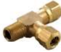
SY1471 MALE TEE