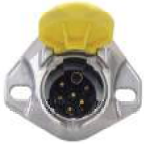
SY6103 7 WAY BLADE PLUG