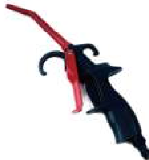
SY9104 Blow Gun