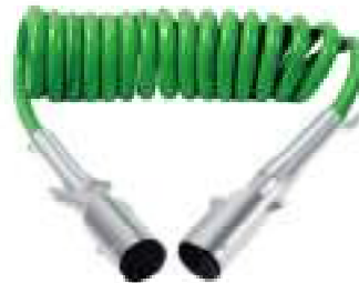
SY6005 7 WIRE ABS CABLE