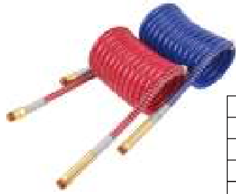
SY9000 AIR COILS