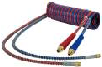
SY9002 AIR COIL