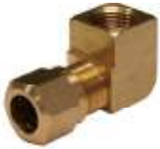
SY1470 FEMALE ELBOW