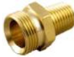
SY1501 MALE ADAPTOR