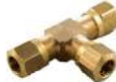
SY1464 TEE UNION