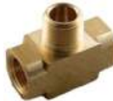
SY7887 FEMALE TEE