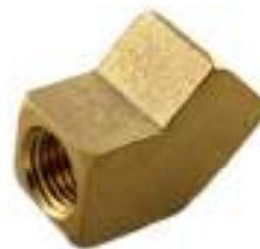
SY7883 UNION ELBOW