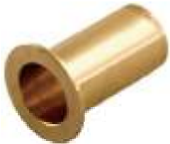
SY1481 TUBE INSERT