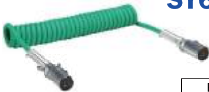
ONE WIER POWER CABLE