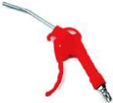
SY9102 Blow Gun