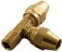
SY1171 TEE UNION