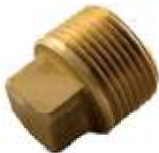
SY7737 HEAD PLUG