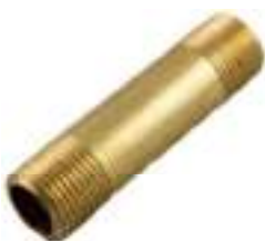
SY7729 LONG NIPPLE