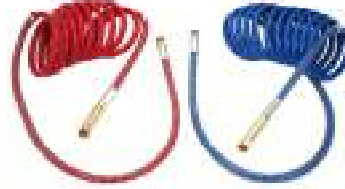
SY9001 AIR COILS