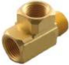
SY7888 FEMALE TEE