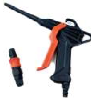
SY9102 BARBED AIR CHUCK