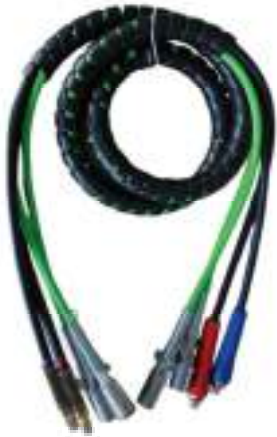
SY6002 FOUR IN ONE