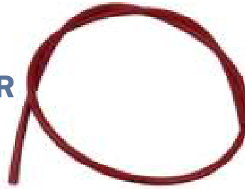
SY9008 DOT DOUBLE LAYER AIR HOSE-PA12-RED