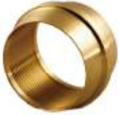
SY1460 SLEEVE FOR NYLON TUBE