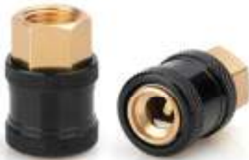
SY9204 SELF-LOCK AIR CHUCK