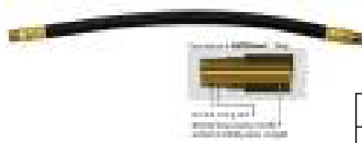
SY9010 SWIVAL BARB HOSE