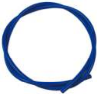
SY9009 DOT DOUBLE LAYER AIR HOSE-PA12-BLUE