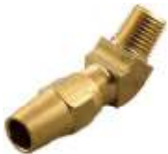
SY1174 MALE ELBOW