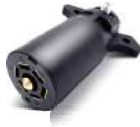
SY6104 7 WAY BLADE PLUG