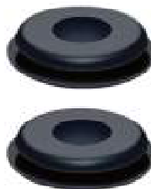
SY5101 GLADHAND RUBBER