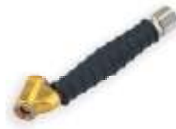
SY9205 AIR CHUCK