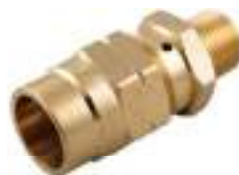
SY1492 MALE CONNECTOR