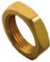
SY7731 LOCK NUT