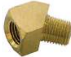
SY7885 FEMALE ELBOW