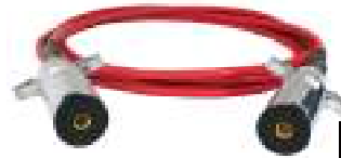
ONE WIRE POWER CABLE