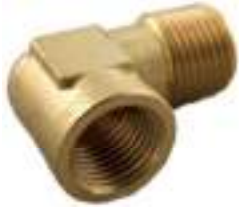
SY7886 FEMALE ELBOW