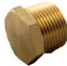
SY7734 HEX HEAD PLUG