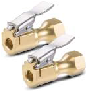
SY9200 NPT1/4-AIR CHUCK