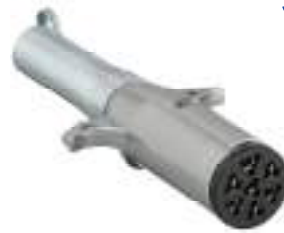
7 WAY PLUG