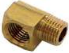
SY7884 FEMALE ELBOW