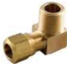
SY1469 MALE ELBOW