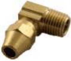
SY1169 MALE ELBOW