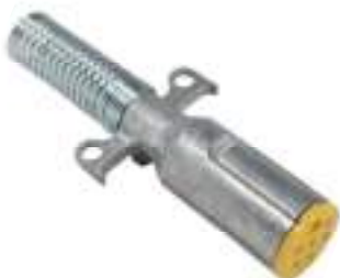
7 WAY PLUG