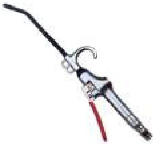
SY9103 Blow Gun