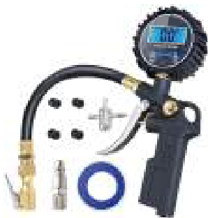
SY9206 INFLATOR GUAGE SET