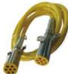
SY6007 7 WIRE ABS CABLE