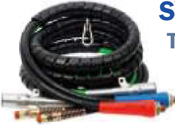
SY6000 THREE IN ONE