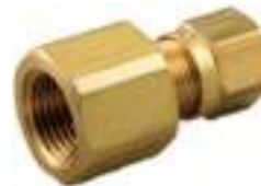
SY1466 FEMALE UNION