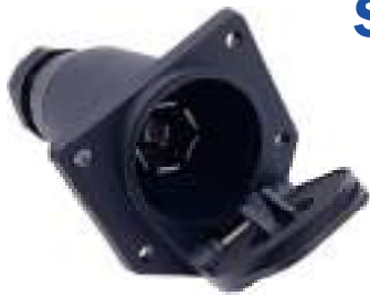
SY6104 7 WAY BLADE SOCKET