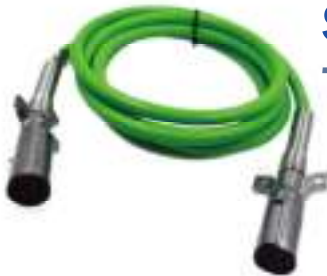
SY6006 7 WIRE ABS CABLE