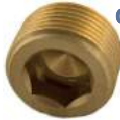
SY7732 COUNTERSUNK HEX PLUG