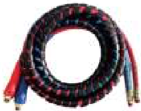
SY9004 TWO IN ONE