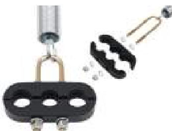
SY6203 HOSE HOLDER