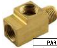
SY7898 Hydraulic brake Tee