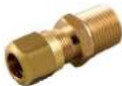
SY1468 MALE UNION